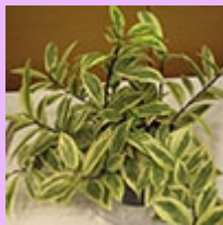
Aeschynanthus Thailand sp. variegated. A rare, variegated, mutation of an unknown species

Write a review before ordering, good or bad, we'd like to know. Get a free plant added to order.